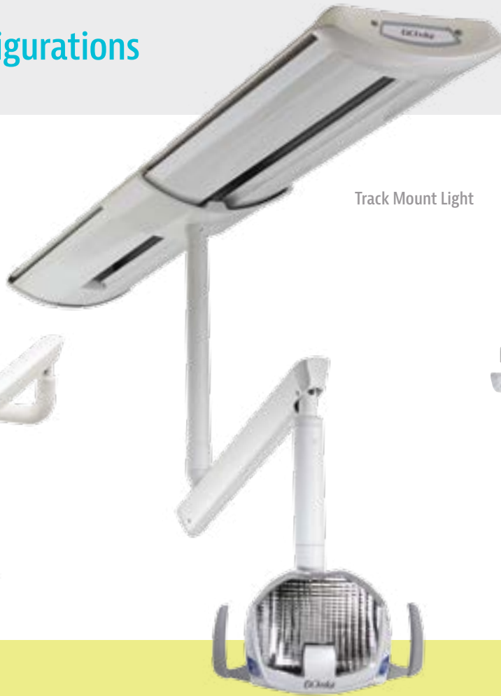
Track Mount Light