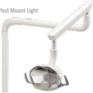
Post Mount Light